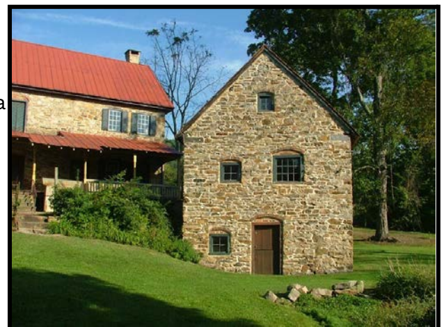
photo: Jacob Keim Homestead