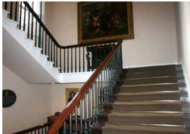
Finished grand stair work.