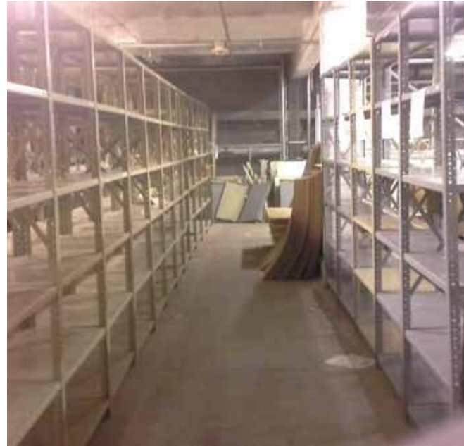
Empty shelves in the Athenæum's Penn Mutual storage area.

After more than two decades in the Penn Mutual Towers, the Athenæum consolidated its off-site storage in newer, cleaner, and climate-controlled facilities in New Castle, Delaware. The move took more than six weeks in May and June and was accomplished with 5 Athenæum staff, 12 professional movers, 5 visits, 11 trucks, and lots of hard work. In all, over 5000 cubic feet of historic collections were transferred, more than half of the Athenæum's architectural collections. The items now stored in Delaware are still available for research. Some of the collections now stored off-site include the AIA Philadelphia Chapter, Cret, Durham, Dagit, D'Ascenzo, Dickey, Hayes & Hough, Lovatt, Magaziner, Price & McLanahan, Rankin & Kellogg, Wanamaker, and others. Please contact Curator of Architecture Bruce Laverty in advance to determine if the items you need to review are off-site and to schedule an appointment.