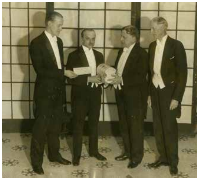
Paul Cret receives the 1930 Philadelphia award. Connie Mack, is on the right.