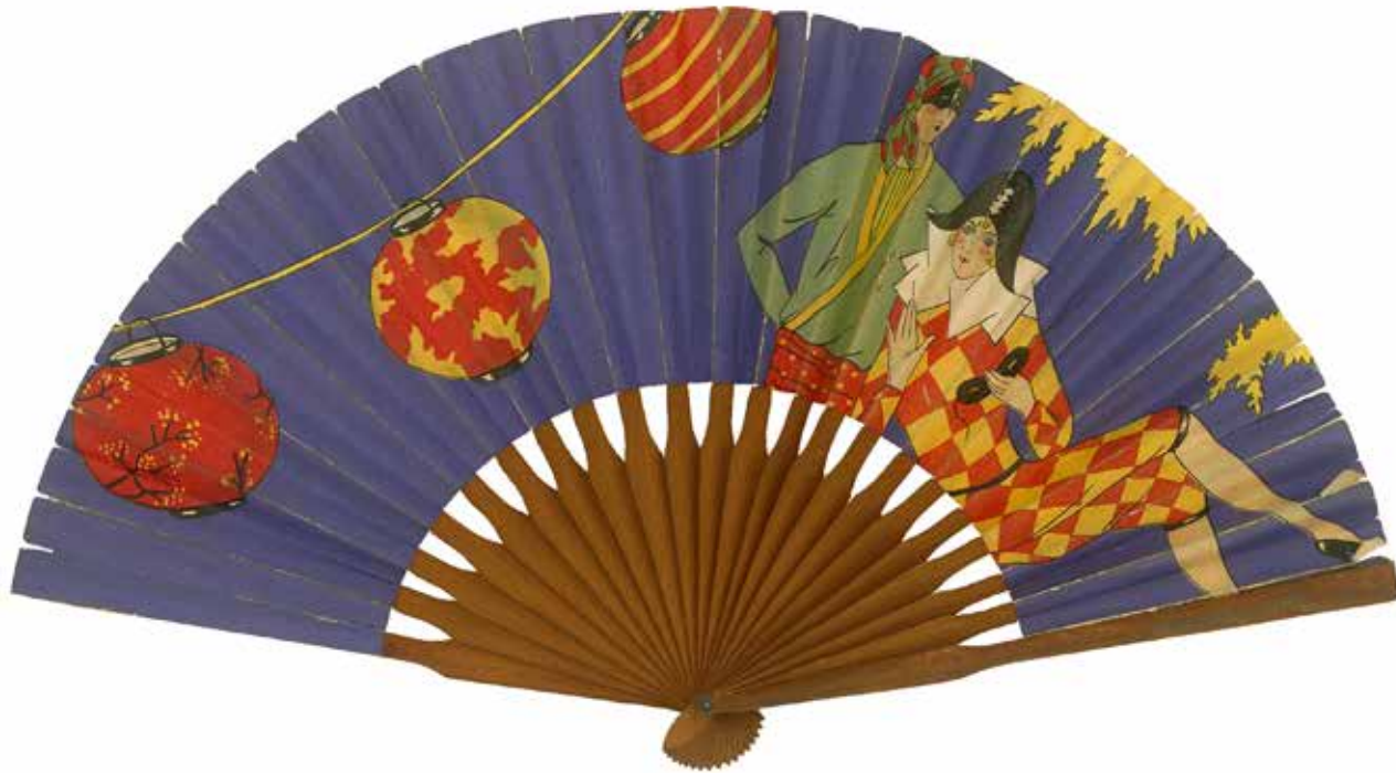
Early twentieth century folding fan with printed paper leaf and wood frame, advertising the Red Star Line transatlantic passenger ship company.