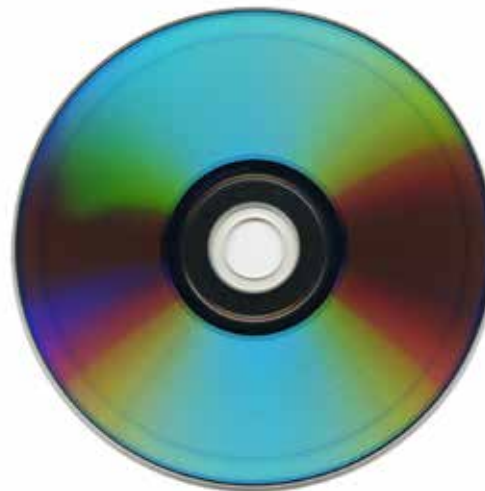
The dark ring about a half inch from the outer edge is a sure sign of bad tracks on this disk.