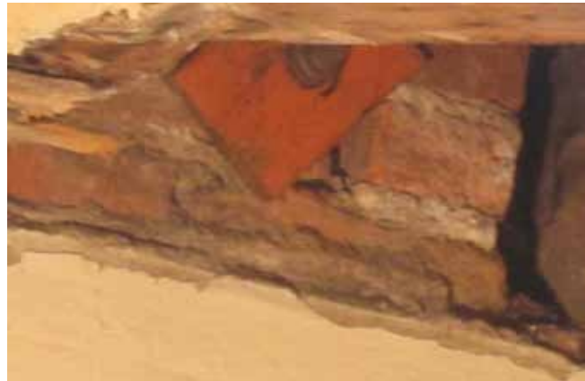
Metal plate exposed during grand stair work, July 2014.

As has often been the case, the Annual Report must focus at least in part on the construction in the building, some of which you may have yourself experienced. In summer 2013 the major project involved repair of the lantern/skylight which had been silently leaking for some time. Evidence of this could be discovered by examining the southeast corner of the ceiling of the Grand Stair where moisture had slowly and repeatedly defaced the plaster molding so that the details were blurred beyond recognition. Finding the exact source of this moisture penetration took some detective work by our roofers, but eventually the Superintendence Committee felt secure in undertaking the repair project. The construction took several months, but at the end we hoped that the moisture penetration was remedied. The Athenaeum also restored the chandelier at the same time. However, although it was clear that the walls of the Grand Stair also required re-plastering and re-painting, the Superintendence Committee wisely decided to wait to be sure that all leaks had been removed. After the hard winter we hired roofers to probe the southeast corner to make sure that no moisture could be detected. After they assured us that they could discover no new moisture intrusions, it was time to consider the wall repair work. In May 2014 the Special Appeal went out to support this project,