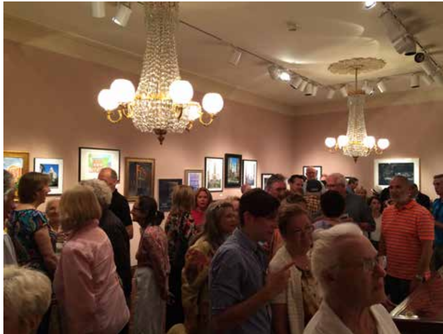
Opening day of the art exhibition.