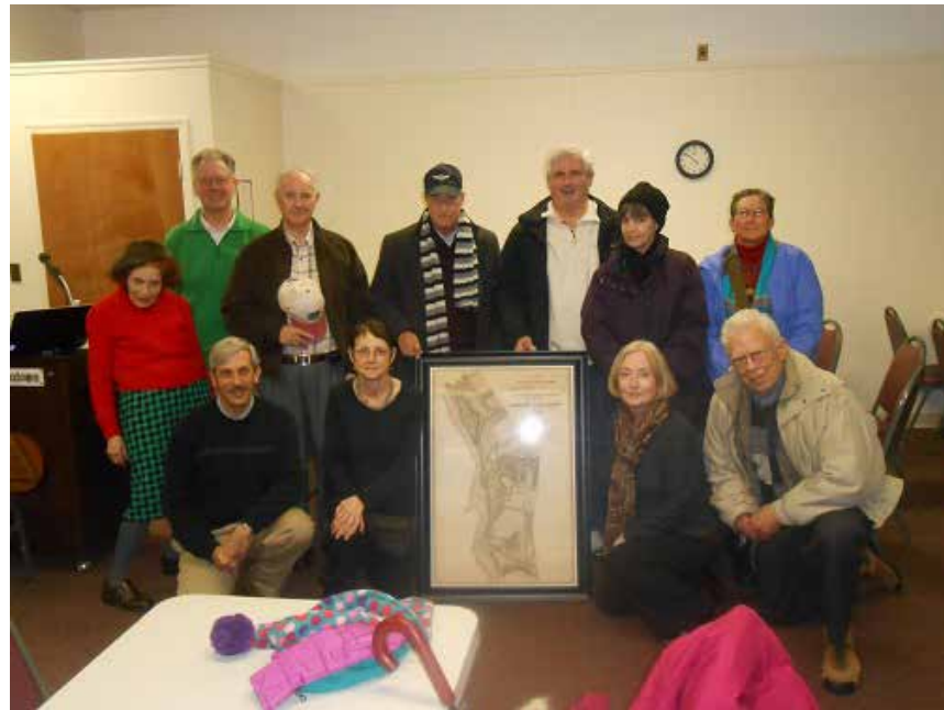
Point Breeze archaeological tour group.

The symposium also marked the move of the Bonaparte Collection from the back hall of the Athenæum into a room which at one point was titled the “Bonaparte Parlor.” This places the exhibition directly across from the Haas Gallery where the Athenæum’s changing exhibitions occur and consolidates our exhibition